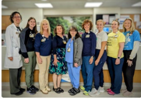
University of Rochester Medical Center Statewide Program Honoree

University of Rochester Medical Center (URMC) is the 2024 March On for Brain Injury Statewide Program Honoree. The Acute Inpatient Rehabilitation unit at Strong Memorial Hospital meets the complex needs of adult and pediatric patients recovering from traumatic brain injury. Led by board-certified and fellowship-trained physician with expertise in brain injury rehabilitation medicine, the multidisciplinary care team is comprised of rehabilitation nurses, physical and occupational therapists, speech and language pathologists, recreational therapists, care managers, dietitians, and psychologists. The focus is restoring independence by improving problems with cognition, balance, strength, motor control, vision, swallowing, and other deficits that adversely affect patients' daily lives.